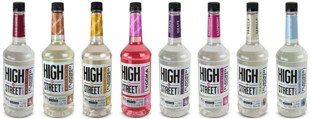
High Street Spirits Flavored Vodkas in 8 flavors.